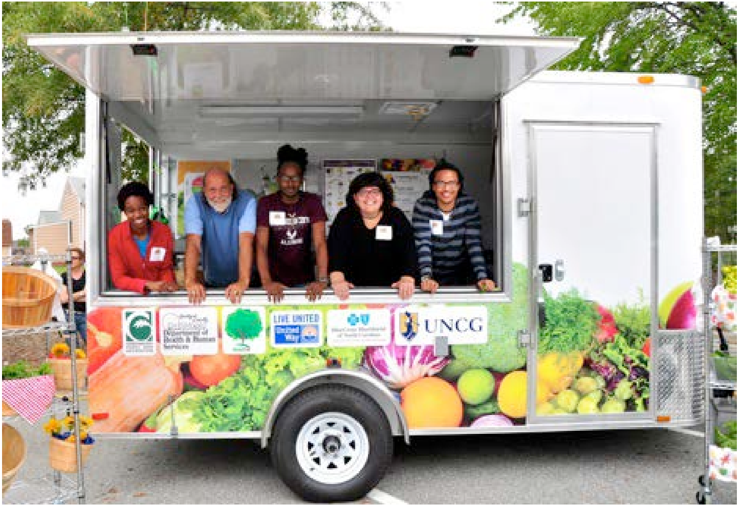
The Mobile Oasis Farmers Market (MOFM)

To begin our story it is critical to provide some basic knowledge about what a food desert is. As outlined in the Nutrition Digest of the American Nutrition Association : a food desert is a part of the country vapid of fresh fruit and vegetables and other healthful foods, usually found in impoverished areas. This is largely due to a lack of grocery stores, farmers markets, and healthy food providers. This has become a big problem because while food deserts are often short on whole food providers, especially fresh fruits and vegetables, they are heavy on local quickie marts that provide a wealth of processed, sugar, and fat laden foods that are known contributors to our nation's obesity epidemic.